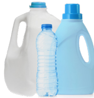
Plastic Bottles & Jugs Botellas y Receptáculos de Plástico