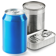
Metal Cans Latas de Metal