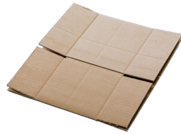
Flattened Cardboard Cartón Aplanado

COLOQUE sólo estos artículos en el contenedor de reciclaje